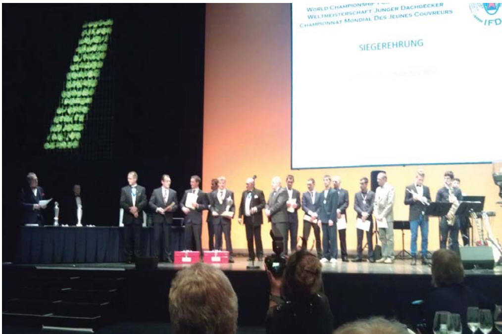
The top three winners of the Industrial roofing, metal roofing category