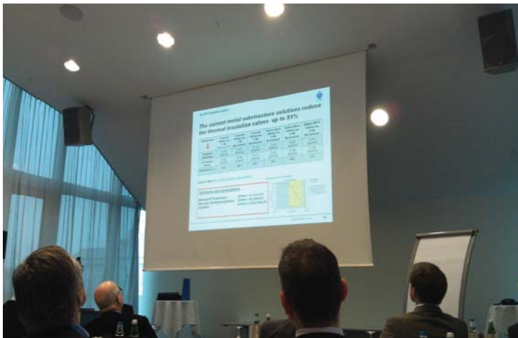
The Scientific Committee