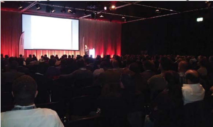
IFD Symposium – Waterproofing