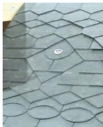
Winners of the Free style competition