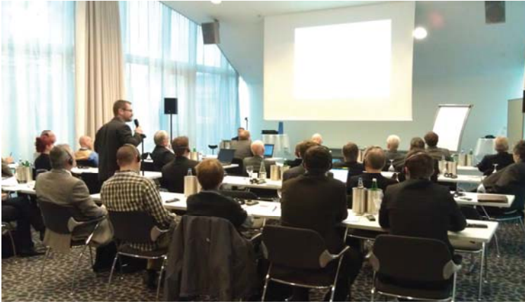
IFD Congress – Pitched roof and Wall Cladding