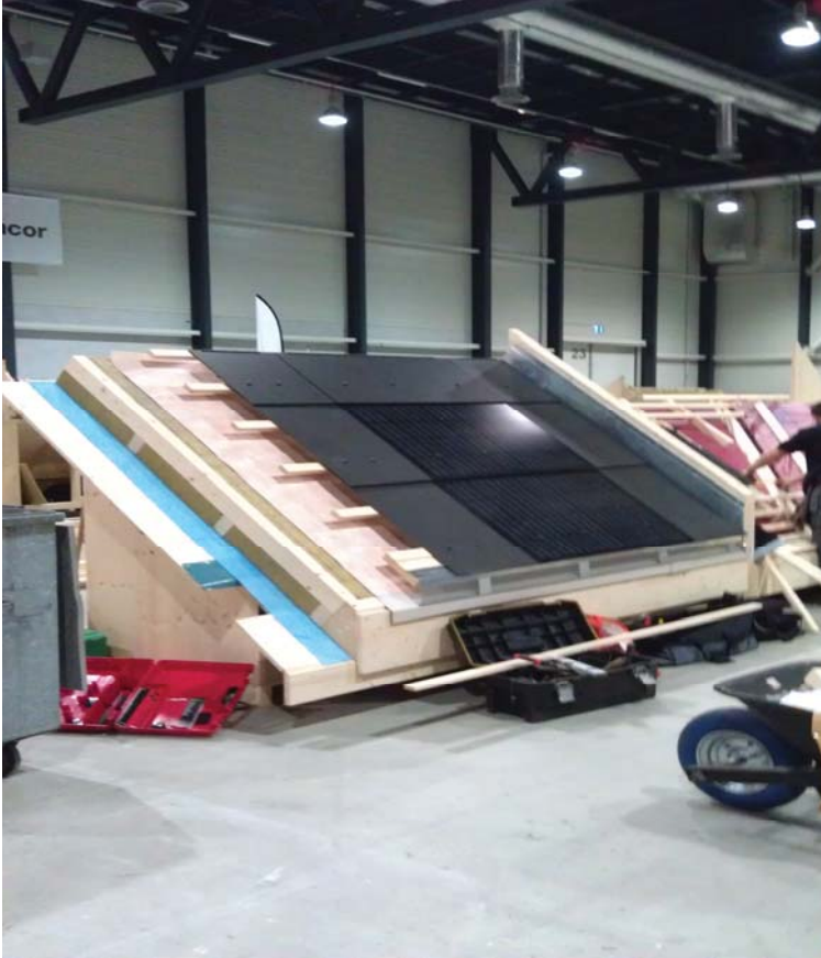
Great Britain's Eternit Roof completed

The second day was a style of roofing called Swiss valley. The roofers installed a taped underlay, timber counter and cross batten, clay beaver tail style tile, Velux skylight, copper eave trim, copper step flashing and cover trim.