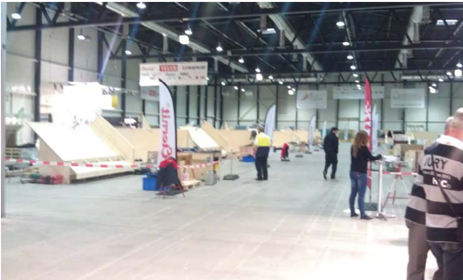
The competition floor